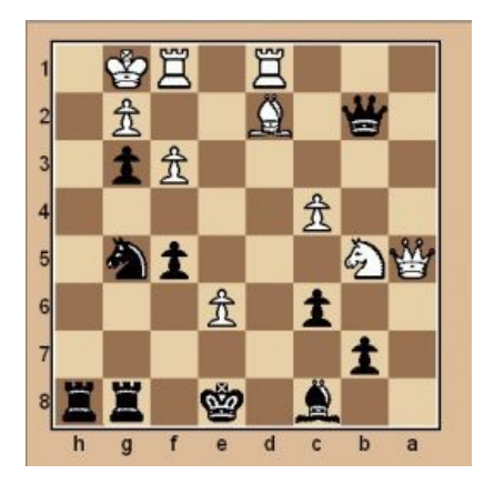
PUZZLE 1 (white to play)